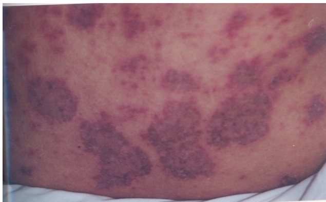
Figure 2 : Glucagonoma Syndrome-Skin Eruptions