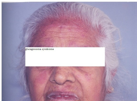
Figure 1 : Patient of Glucagonoma Syndrome showing Stomatitis

A 65 years old female patient came in our skin out- patient department for medical attention and treatment of extensive skin rash over her body. She had history of on and off skin rash for the last one year but the present complaints were of two to three months duration. Superficial erosions with blistering at places started on the lower abdomen and groins with mild itching. (Figure 2) Later on the skin lesions progressed towards extremities and back. These changes were accompanied by angular stomatitis and painful glossitis. (Figure 1) She was diabetic for the last 7 years and at the time of presentation her diabetes was uncontrolled. She had lost 7.5 Kg weight in the past 3 months. She had already taken many treatments for the problem with partial relief so she was very upset that whether she will be alright or not and was on antidepressants.