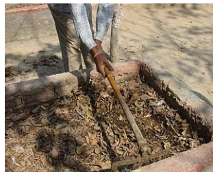
Compost ready for turning