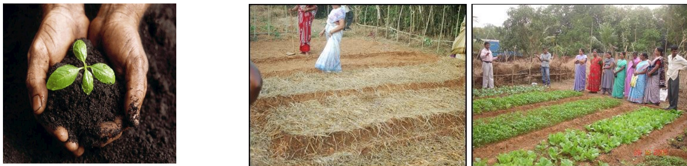
Figure:11 Applying manure to the Soil