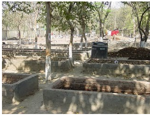
Structure for composting