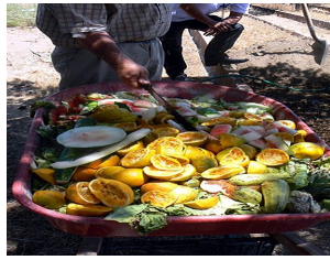
Suitable organic wastes