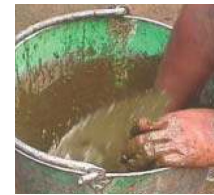
Cow dung Slurry