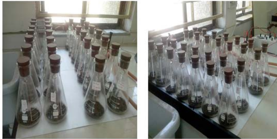
Figure 1. Pictures showing incubation chambers prepared for taking readings

The mean data (Tables 1 to 4) on CO 2 evolution against various fortification levels of chlorpyrifos indicated the trend of a gradual decrease of CO 2 evolution initially up to 20 days and then, a very gradual increase of CO 2 evolution as against the increasing levels of fortification of the soil after 20 days as seen in Figure 3.