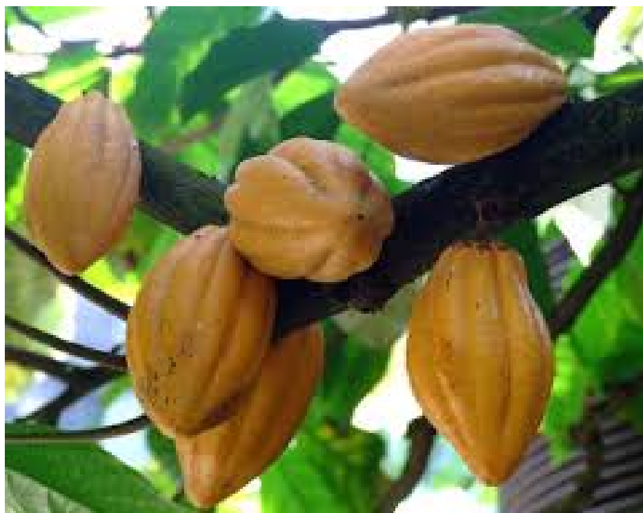
Fig-1: Cocoa Fruit