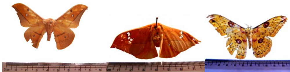
Cricula trifenestrata (male)