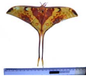
Actias maenas (male)