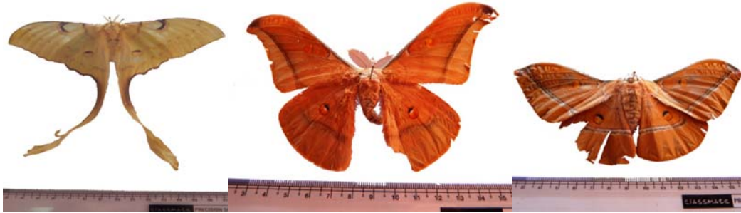
Actias maenas (female)