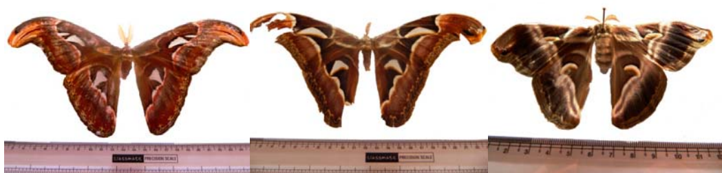
Attacus atlas (male)