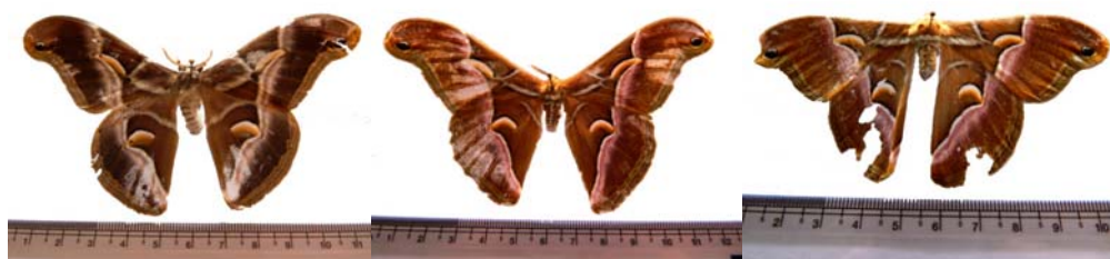
Samia ricini (female)