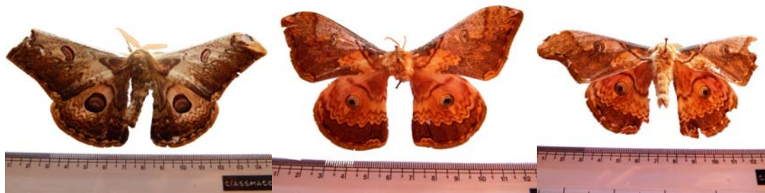
Caligula zuleika (male)