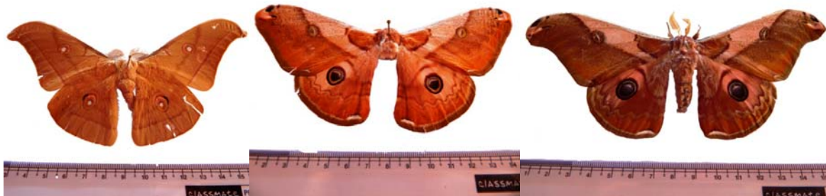
Antheraea roylei (male)