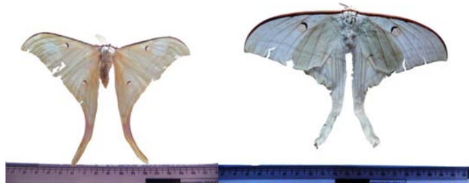
Actias selene (male)