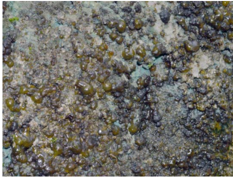
Fig 1. Habitat