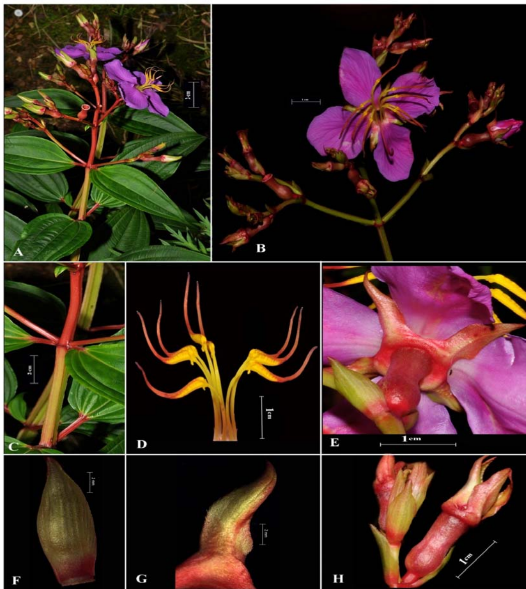
Fig.1. Osbeckia nayarii Giri A. Twig; B. Inflorescence; C. Quadrangular winged stem; D. Stamens; E. Hypanthium & Sepal; F. Bract; G. Sepal; H. Hypanthium. (from prashob P & Sibichen M. Thomas 6018).

Erect perennial shrub, 1-1.5 m high, glabrous throughout. Stem and branches strongly quadrangular, distinctly winged at angles. Leaves simple, opposite, petiolate; petiole 5-10 mm long, reddish brown; lamina 10-15 × 3-6 cm, elliptic to lanceolate, base and apex acute, 5-7 nerved. Inflorescence a terminal lax panicle, 5-12 flowered, Flowers actinomorphic, tetramerous, pedicellate and bracteate. Bract 10-15 × 2-6 mm, ovate, caducous; Pedicel 3-7mm. Hypanthium 12-14 × 4 -6.5 mm, urceolate, with a distinct neck. Sepals 4, 10-13 × 2.5- 3.5 mm, ovate with a prominent midrib, margin ciliate, caducous. Intersepal emergences absent. Petals 4, 16-20 × 10-14 mm, ovate, pink- purple. Stamens 8, filaments 2-4 cm long, anthers 2-4.5 mm long twisted, pore apical, connective prolonged in to a small indistinctly lobed collar. Ovary 12-14 mm long, urceolate, 4-locular, united with hypanthium, anther pocket and crown covered with appressed hairs; style 2.5-4 mm long, curved; stigma slightly swollen. Capsule 4 - 5.5 mm long, enclosed by an urceolate calyx tube with a long neck (hypanthium). Seeds 0.1-0.2mm long, minute, curved (Fig. 1).