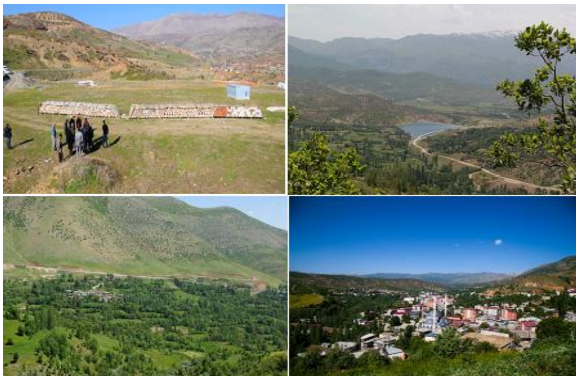
Figure 2. Some photos from study area of Hizan district of Bitlis province.

Pollen analysis was done using the methods defined by Louveaux et al. [20]. The pollen identification and observations were made with an Olympus light microscope (400× or 1000× as appropriate). Pollen types were identified by personal reference and based on the relevant literature. Pollen grains were counted on 2 slides for each honey sample and each pollen types was presented as a percentage with respect to the total counted pollen grains numbers [21, 22, 23]. The amount of pollen ranging: between 19% and 39% was considered as the major group, between 6% and 12% was considered as the minor group, between 1% and 3% was considered as the trace group.