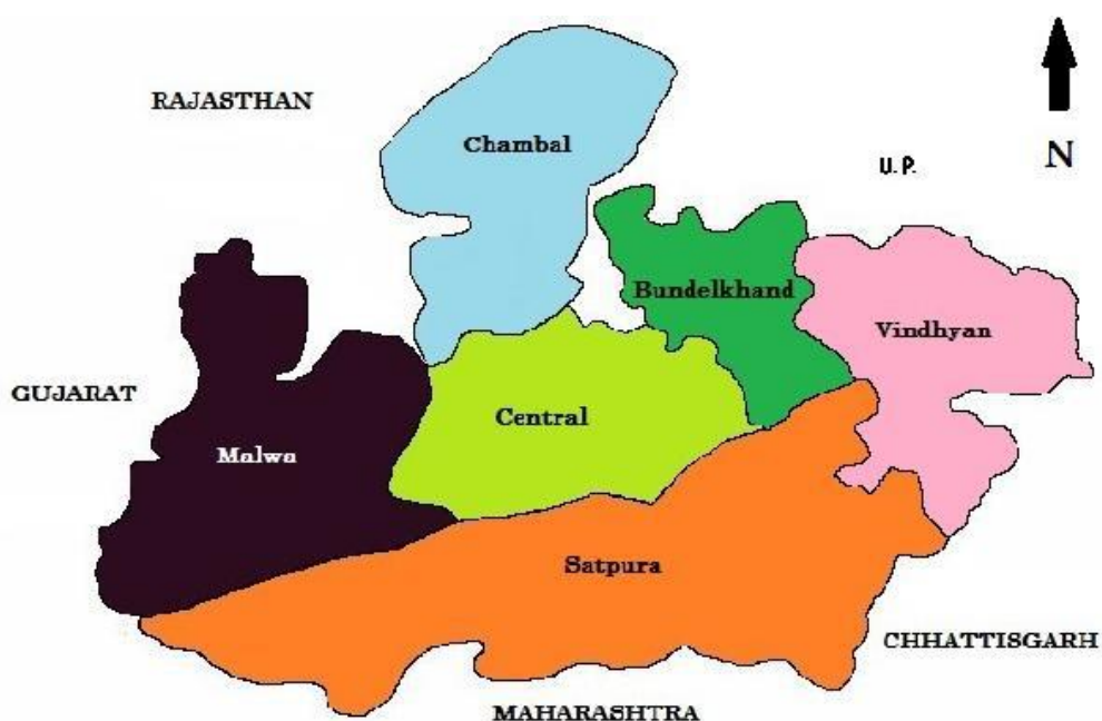
MAP: ECO-REGIONS OF MADHYA PRADESH

Geographically, the state can be divided into regions- Malwa, Nimar, Bundelkhand, Chambal, and Baghelkhand, Mahakoshal and the central Vindhya and Satpura regions. The altitude varies from 300-1100 m ASL and temperature varies from minimum 0 to 45°C. The Malwa region occupies plateau in western Madhya Pradesh and south- eastern Rajasthan (between 21°10'N 73°45'E and 25°10'N 79°14'E), with Gujarat in the West. The region includes the Madhya Pradesh districts of Dewas, Dhar, Indore, Jhabua, Mandsaur, Neemuch, Rajgarh, Ratlam, Shajapur, Ujjain, and parts of Guna and Sehore, and the Rajasthan districts of Jhalawar and parts of Banswara and Chittorgarh. Malwa is bounded in the north-east by the Hadoti region, in the north-west by the Mewar region, in the west by the Vagad region and Gujarat. To the south and east is the Vindhya Range and to the north is the Bundelkhand upland.